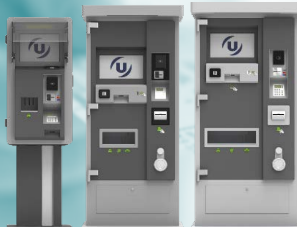
OTT for Ticket Purchase & Delivery