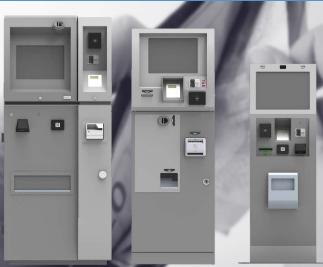
APS for Payments