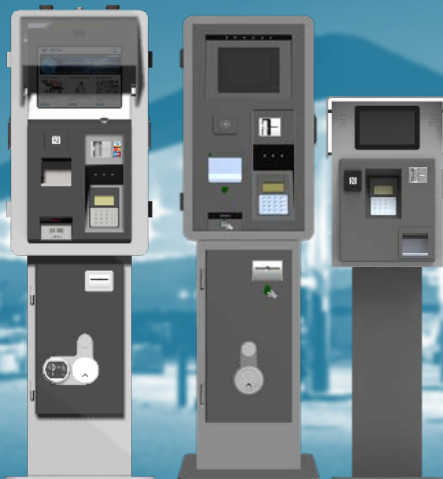
OPTs for Self Service Refueling