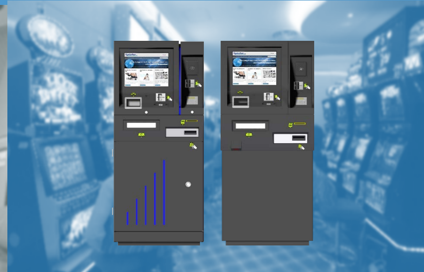
URM for Gaming