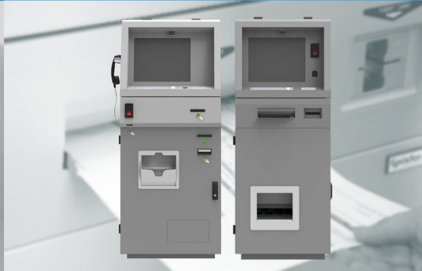
ADSS for Document Handling